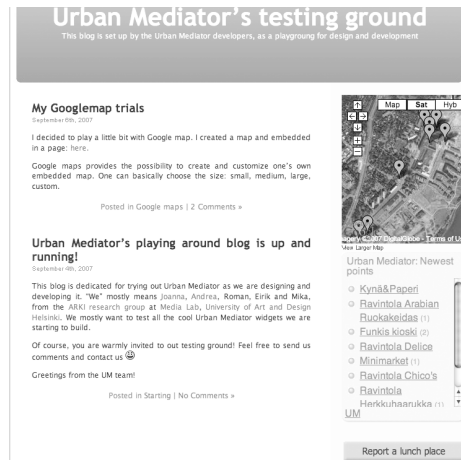
Fig. 2. A Google map showing UM data is embedded along with UM web widgets on a website (in this case the UM development blog).

Using mashups can lead to flexible designs benefiting from rigid, simple building blocks. This enormously facilitates overall design efforts as building blocks become more comprehensible by stakeholders than traditional building blocks found in software design. These extra components also served as means to illustrate possible courses of development and showcase for encouraging more collaborative, user-designable, ecosystemic software [21].